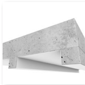
Flat concrete ceilings, concrete walls and concrete beams