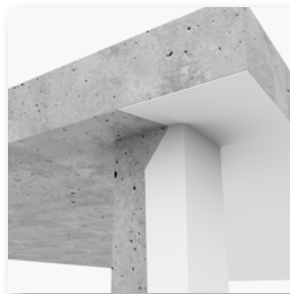
Flat concrete ceilings and concrete columns