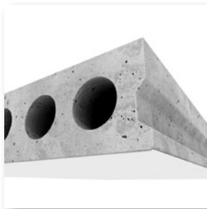
Concrete hollow core slabs